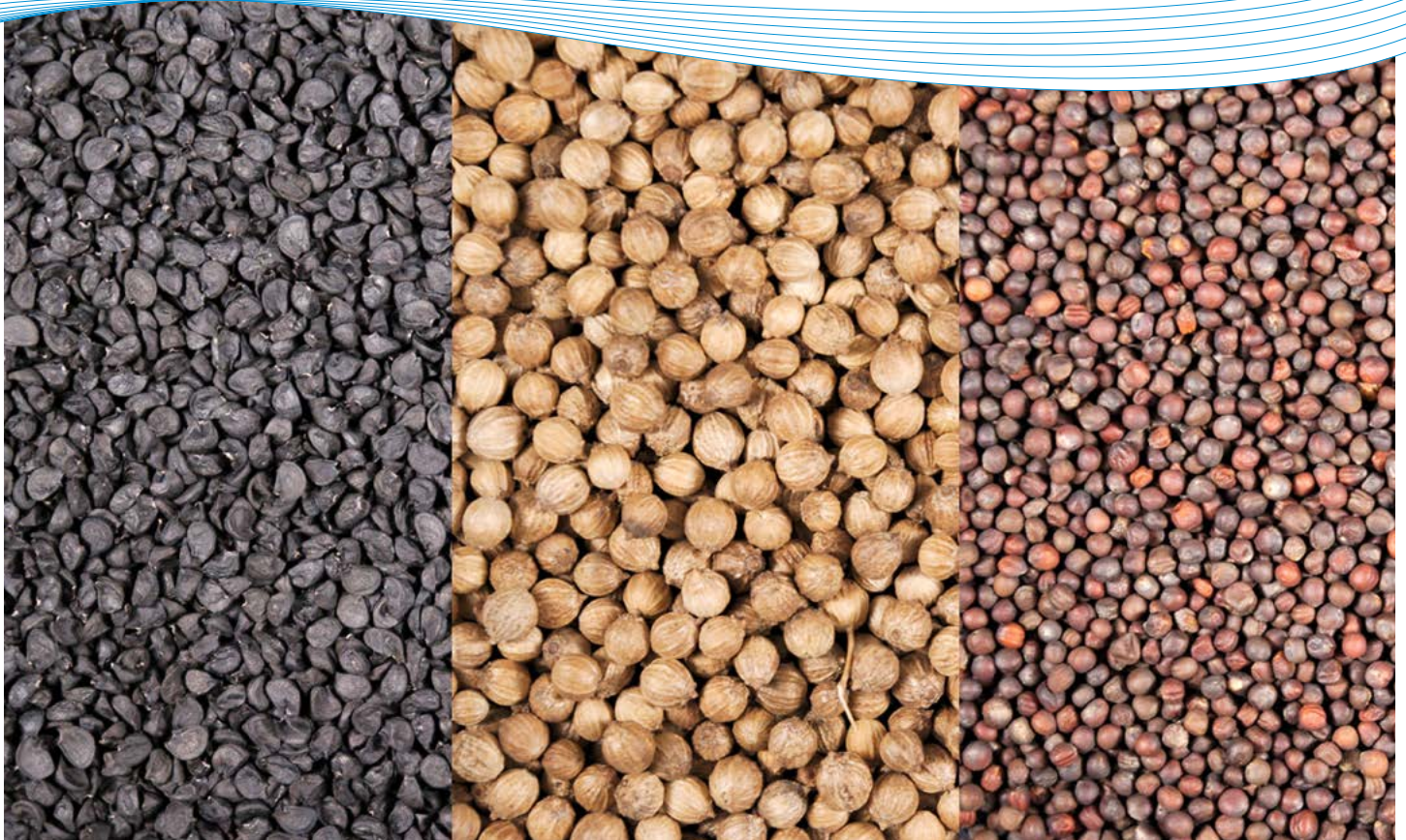
Figure 1. Untreated onion, coriander and Brassica seed

Seeds represent a significant and essential proportion of the input costs in vegetable production. This factsheet has been produced following requests from growers for guidance on how to get the best from seed and therefore maximise the value returned from the initial investment.