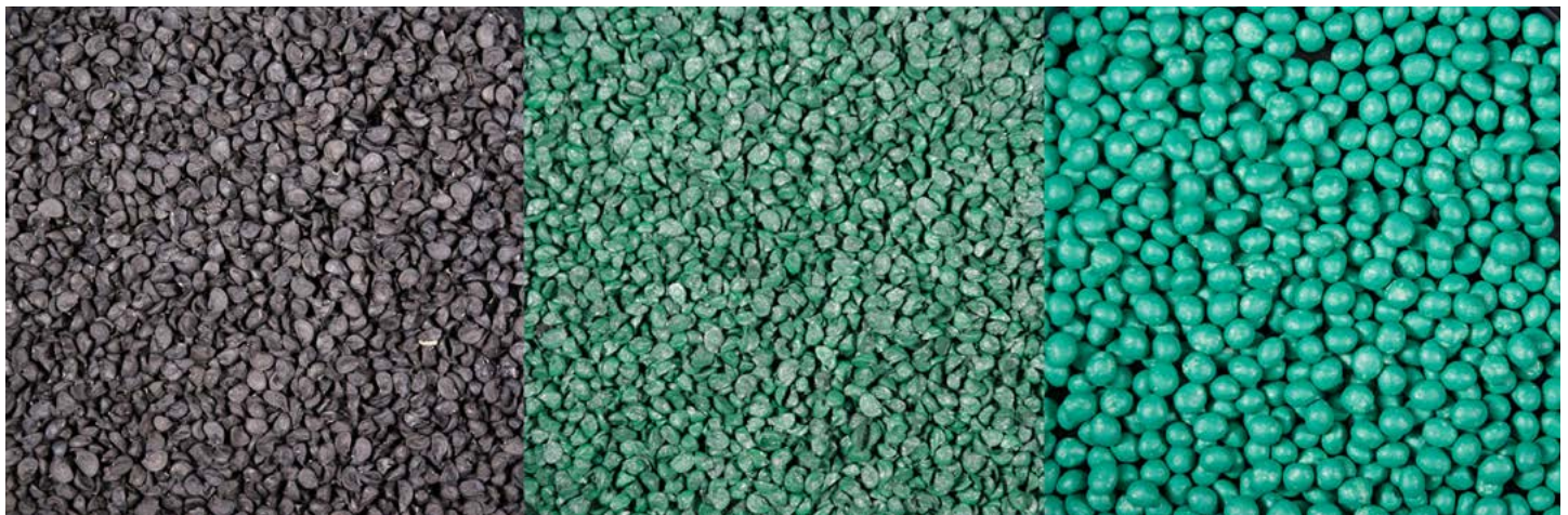
Figure 2. Untreated, film-coated and pelleted onion seed