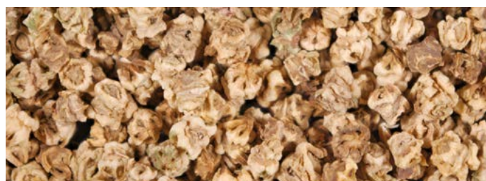
Figure 6. Untreated beetroot seed

Keep detailed records of the seed lot numbers, the treatments applied, the date of delivery from the supplier, storage conditions, and date of sowing/drilling, plus other relevant operational information and any other information obtained from the supplier, such as germination and seed health test results.