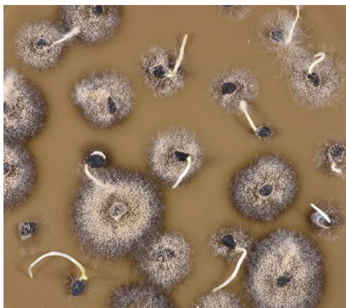
Figure 4. Seed testing for Botrytis aclada/allii (onion neck rot)

It is important to be aware of the targets and efficacy/ mode of action of fungicide seed treatments in particular. Most general-purpose fungicide treatments are primarily effective against the soil-borne fungi that cause damping off and reduce emergence. They may have little activity or be ineffective against specific seed-borne pathogens. Some fungicides may be merely inhibitory to the target pathogen; subsequent seed tests may indicate the absence of the pathogen, but it may still survive on the seed and be transmitted to the seedling (see AHDB Horticulture-funded project FV 423a for an example in onions and neck rot).