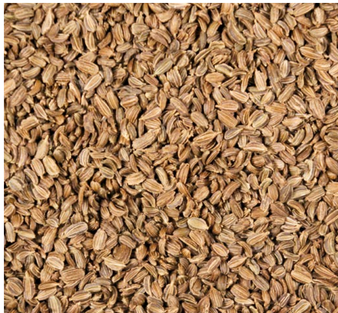
Figure 5. Untreated carrot seed

It is also important to be aware that at the point of delivery seed may already have been stored for one or more years by the supplier. Suppliers are obliged to label the seed with the year of packaging or the last germination test, but there is no requirement to indicate the year of production.