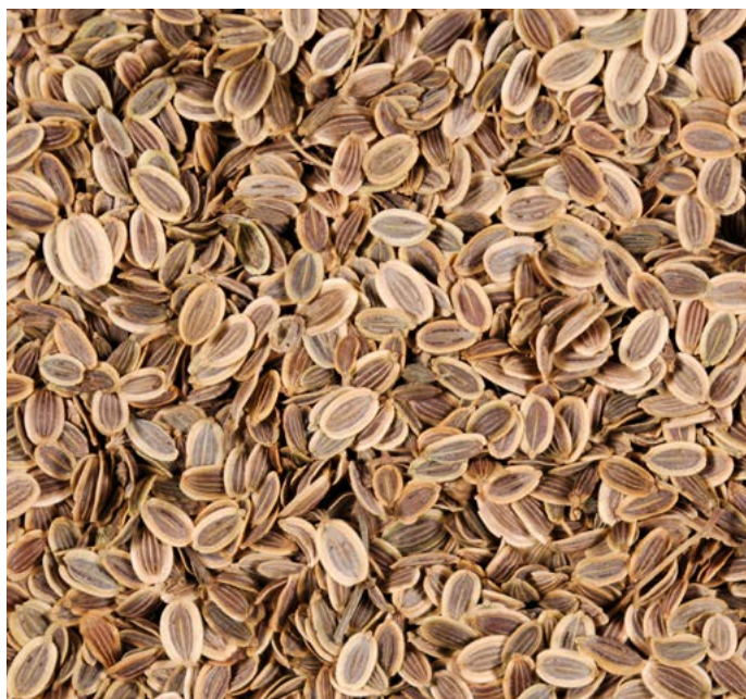
Figure 7. Untreated Dill seed