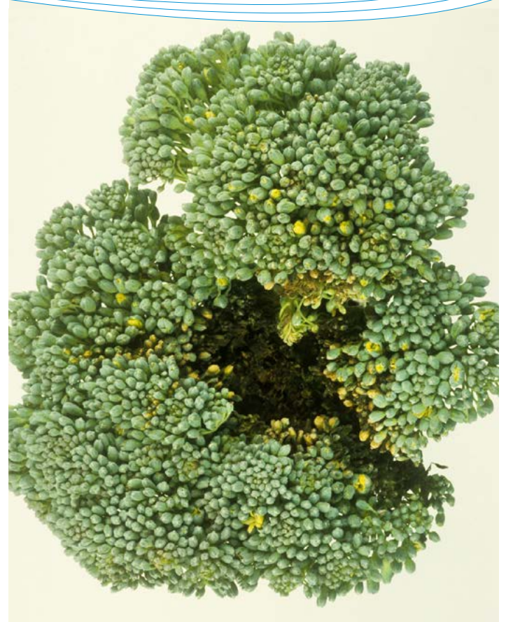
Figure 2. Progressive rot of whole head

Spear rot (or head rot) of calabrese and broccoli can be a major cause of losses in the UK. Estimates of losses vary, but the most recent suggest average losses of around £3.7 million per annum.