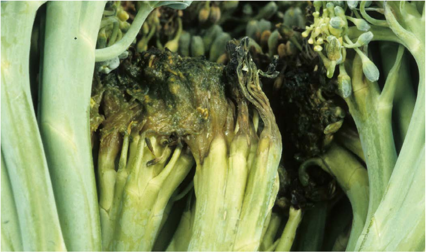
Figure 3. Cross-section of an affected calabrese head

Another pectinase-producing bacterium, Pectobacterium carotovorum subsp. carotovorum (formally Erwinia carotovora ), is often isolated and has sometimes been described as the primary cause, but it is more likely that Pectobacterium is a secondary invader of rots already initiated by Ps. fluorescens or other pathogens such as downy mildew or Botrytis , or following physical damage from hail or frost, etc. Two key factors have contributed to the confusion: the addition of wetters in inoculation experiments and the inoculation of, or production of, plant material for inoculation in protected environments.