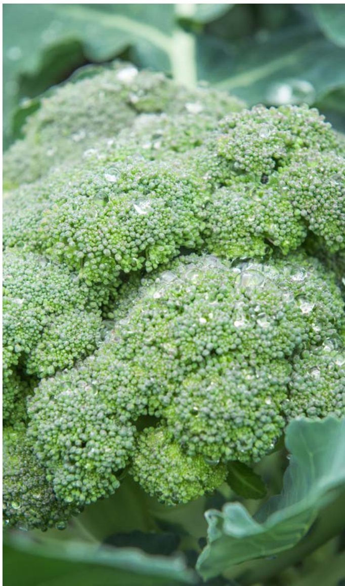
Figure 4. A good wax coating on the head that encourages beading of water droplets reduces susceptibility to spear rot

It is important to be aware that tests done on heads from plants raised under protection can give spurious results (more susceptible), due to the effects of the growing conditions on surface wax.